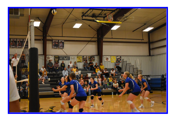
The Lady Longhorns beat the Mullen Broncos.

They had a very fun season and the Seniors will be missed dearly, but the rest of the girls are looking forward to many more great years of playing volleyball.