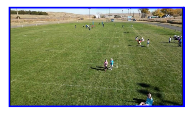
The elementary students play games on the football field for their 100 steps celebration.

The elementary students had a fun time celebrating reaching 100 steps. The 200-Step Celebration will be held on November 22nd. We are hoping ALL elementary students will reach the goal in November.