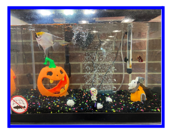
Elementary Fish Tank