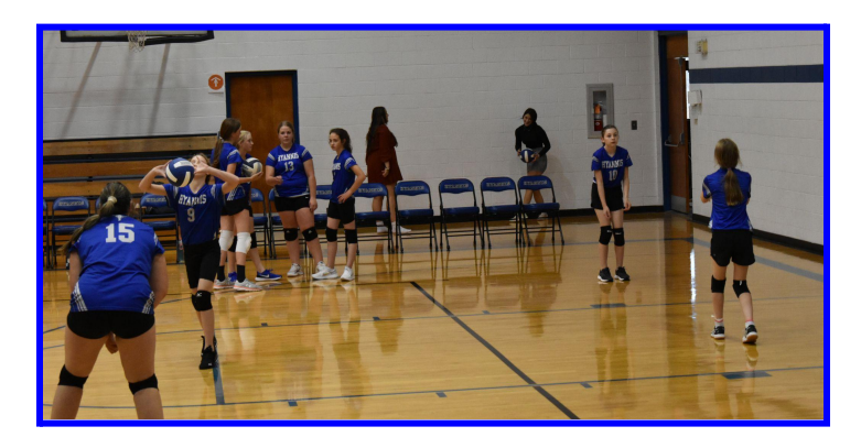
The Junior High girls warm up before a game

The Longhorns won a set against Dundy County, two sets against Hemingford, one set against Sandhills Valley, one set against Crawford and Cody Kilgore. They also played Mullen and Sandhills Thedford this season. They played their best and should be proud of their hard work.